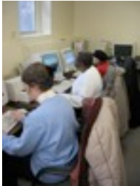
Guests Enjoy Computer Classes p 1