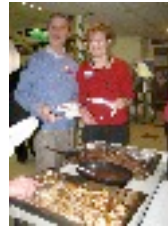
Volunteer Appreciation Dinner p 3