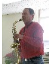
New music at Toni's p 2