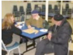
Fun at Toni's Living Room p 2