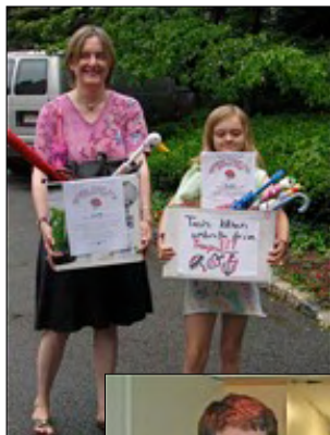
Left: After donating dozens of boxes of Girl Scout cookies, Montclair Brownie Troop 319 initiated an umbrella drive and helped keep our guests dry over the wet summer.

Our Donors: We're fortunate to have the support of many businesses and individuals in our community. Here are some of those who've given generously this summer.